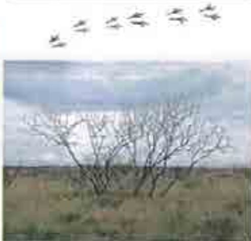
Mesquite stands in the way of a successful birdland landscape.

Mesquite outcompetes desirable grasses and forbs, thus reducing quality and quantity of nesting habitat for LPC. Removal or reduction of mesquite in lesser prairie-chicken habitat, followed with proper grazing management, can increase production and composition which will benefit grassland species.