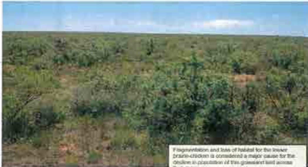
Fragmentation and loss of habitat for the lesser prairie-chicken is considered a major cause for the decline in population of this grassland bird across their range.

Honey Mesquite ( Prosopis spp.) is universally accepted as an invasive and highly competitive shrub that may readily encroach onto landscapes that did not historically support the species. This landscape has experienced intense disturbance or changes in natural ecological processes over a significant period of time. Through interspecific competition with other beneficial plant species, mesquite has increased in frequency, and subsequently led to a transition from grassland landscapes into shrub/grasslands which is less desirable for grassland birds, specifically lesser prairie-chickens (LPC). Research shows that LPC avoid areas with more than 1% mesquite canopy cover due to changes in vertical obstruction and conversion to shrub-dominated landscapes, which greatly limits desirable habitat for this species.