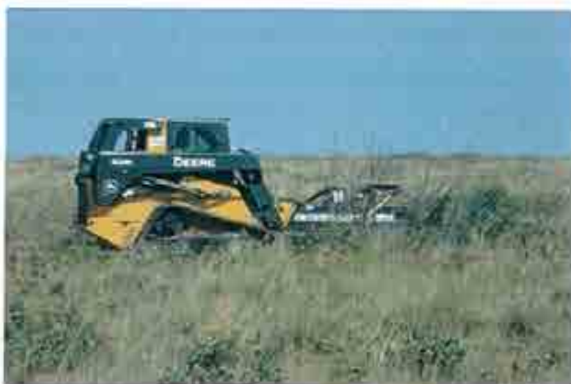
Skid Steer Removing Dead-Standing Mesquite

Once the previously treated mesquite plant is dead, the skeleton of the plant is still a vertical structure that must be removed in order to achieve the greatest conservation benefit for the LPC.