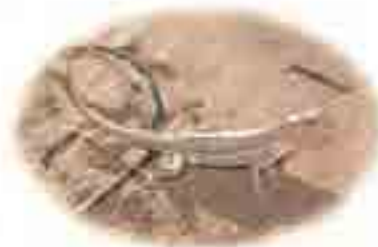
The Dunes Sagebrush Lizard is native to a small area of southeastern New Mexico and west Texas.

C andidate Conservation Agreements (CCAs) allow the U.S. Fish and Wildlife Service (FWS), the Bureau of Land Management (BLM), and the Center of Excellence (CEHMM) to work in cooperation and in consultation with private landowners and industry to support conservation measures for the Lesser Prairie-Chicken (LPC) ( Tympanuchus pallidicinctus ) and the Dunes Sagebrush Lizard (DSL) ( Sceloporus arenicolus ). Both species were warranted for listing under the Endangered Species Act of 1973, as amended (16 U.S.C. § 1531, et seq.). CCAs: