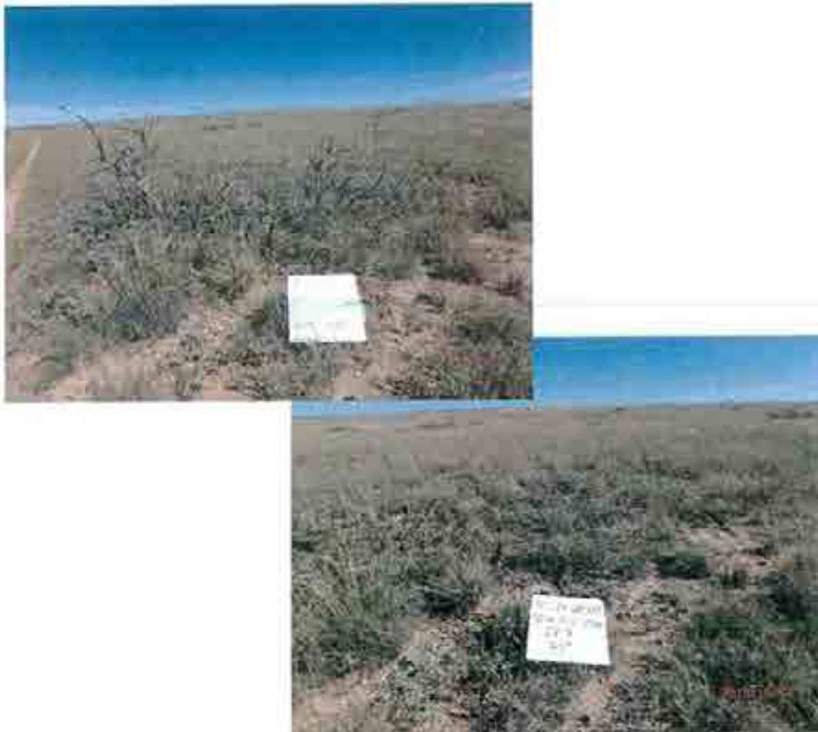
Figure 2. Before and After DSM Removal on the ACEC.

BLM ACEC DSM Removal – This project was approved and funded in 2019 for $21,741.51. Approximately 950 acres of dead-standing mesquite (DSM) were removed from the BLM Area of Critical Environmental Concern (ACEC) (Figure 1). This project started on September 24, 2019 and was completed on October 14, 2019 (Figure 2). Eradicating and removing mesquite opens up habitat for Lesser Prairie-Chicken (LPC) lekking, nesting, and brood-rearing. Once the mesquite plant is dead, the skeleton of the plant is still a vertical structure that must be removed in order to achieve the greatest conservation benefit for the LPC (Appendix B).