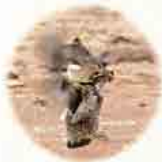
The Lesser Prairie-Chicken is native to parts of Colorado, Kansas, New Mexico, Oklahoma, and Texas.

Under the CCA, federal lessees, operators, or permittees, who join by voluntarily signing a Certificate of Participation (CP), receive a high degree of certainty that additional restrictions would not be placed on their otherwise legal activities if either species is listed. The companion Candidate Conservation Agreement with Assurances (CCAA) provides incentives for voluntary conservation of at-risk species on non-federal lands. By signing a Certificate of Inclusion (CI) under the CCAA, the lessee, owner, or permittee voluntarily commits to implement